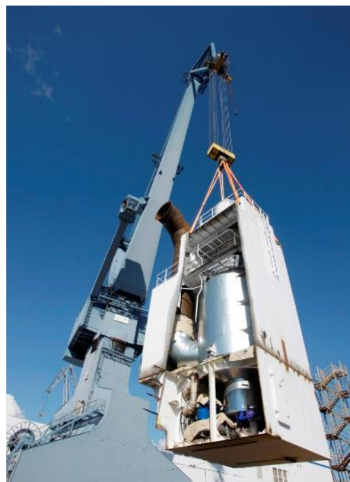
Installation of a closed loop scrubber system

Scrubber OEM selected Honeywell's technology to meet these challenges, standardizing on our SmartLine family of pressure transmitters. These are used to measure differential pressure across the scrubber's filter, which is key to preventing leakages.