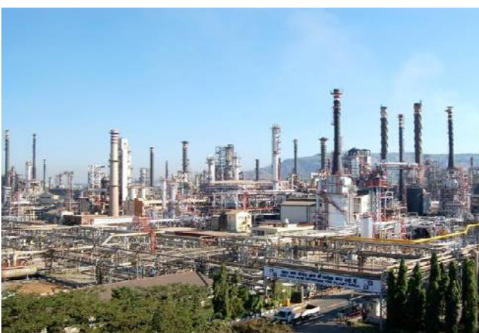
Bharat Petroleum Corporation Limited’s Mumbai Refinery

Recently, Mumbai Refinery has undertaken a refinery modernization project to reduce source emissions, increase its throughput to more than 13 MMTPA, and improve the quality of gasoline and diesel to Euro III and Euro IV standards. This was a unique project because it was fully integrated with the operating refinery in all aspects – crude supply, fuel, water, steam distribution and to blending of all old/new process streams to run to existing tanks.