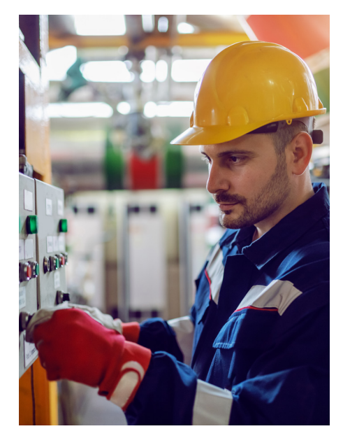
Fig 5: Analyze competency and behavior insights by linking operational data to workers actions.

Assessments feed into in-depth analytics, combining with other available data to provides insights for optimizing the hiring process and mapping resources to more effectively deploy available personnel. We provide you with visibility of your human resources to make the best use of every person. Intelligence from analysis also continually feeds into assessment of skills gaps and training requirements.