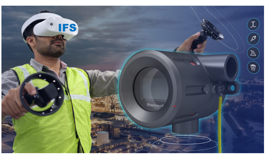
Fig 4: Experts can manage activities remotely and safely in the virtual environment.

For a more objective approach and added insights, we supplement traditional self-assessment and supervisor reviews with data analysis of on-the-job performance to identify gaps in knowledge and skills. Drawing value from your plant data, Honeywell pinpoints the tasks where trainees