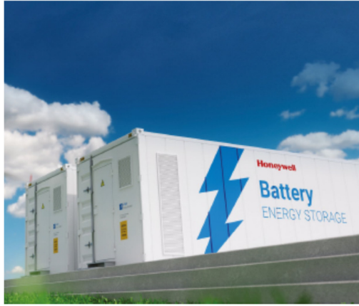
Figure 2: Industrial sites can maintain redundancy as the GT-BESS system operates in parallel with the gas turbine as a hot standby.

With Honeywell's approach, a remote operating site can maintain redundancy as BESS operates in parallel with the GT as a hot standby. Should the operating turbine trip, the BESS seamlessly takes over the baseload to avoid any power disruption. The system enables restarting of the tripped GT or back-up power and then returns to the normal operating regime.