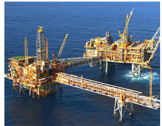
At remote industrial operating sites, companies are faced with the increased cost of fuel for power generation while trying to maintain reliable energy assets and minimize maintenance requirements.

Facilities like offshore platforms are inherently energy-intensive, with on-