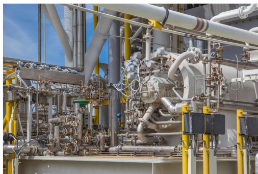
Figure 1: Site operators that are able to shut down one gas turbine can save a significant amount of gas through lower “idling” consumption.

However, the latest innovations in BESS technology offer the same, if not more, reliable power with higher efficiency and lower emissions.